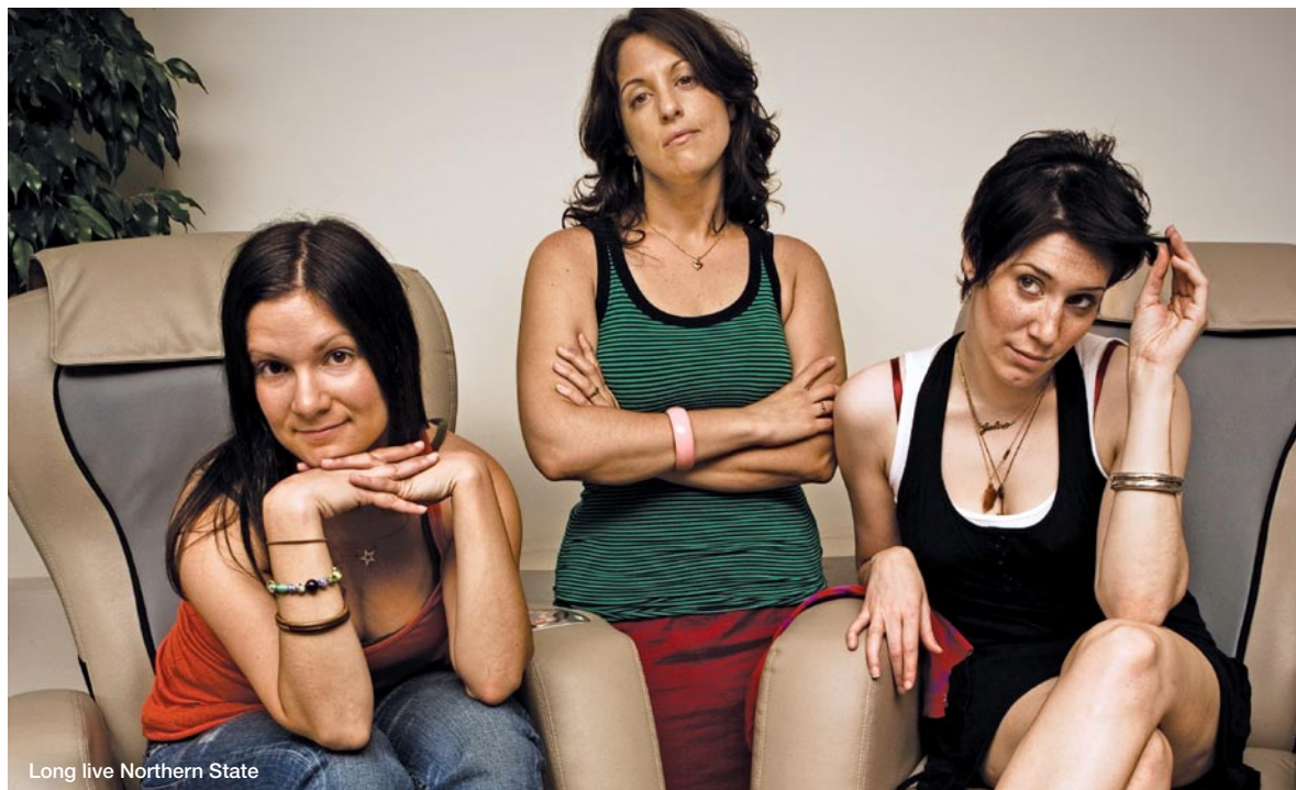
Long live Northern State